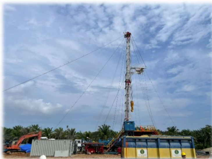
Fig 1. Drill Rig Preparation on BA-01 well site

BA-01 is planned as a vertical exploration well approximately 2800ft in depth and will be suspended if successful. The well aims to test the presence of hydrocarbons in the BA prospect, primarily targeting the Miocene-age Telisa Formation sandstone reservoir located at a depth of 900ft. A secondary target is the Menggala Formation, expected at approximately 2500ft. Both targets are producing reservoirs in the Central Sumatra Basin.