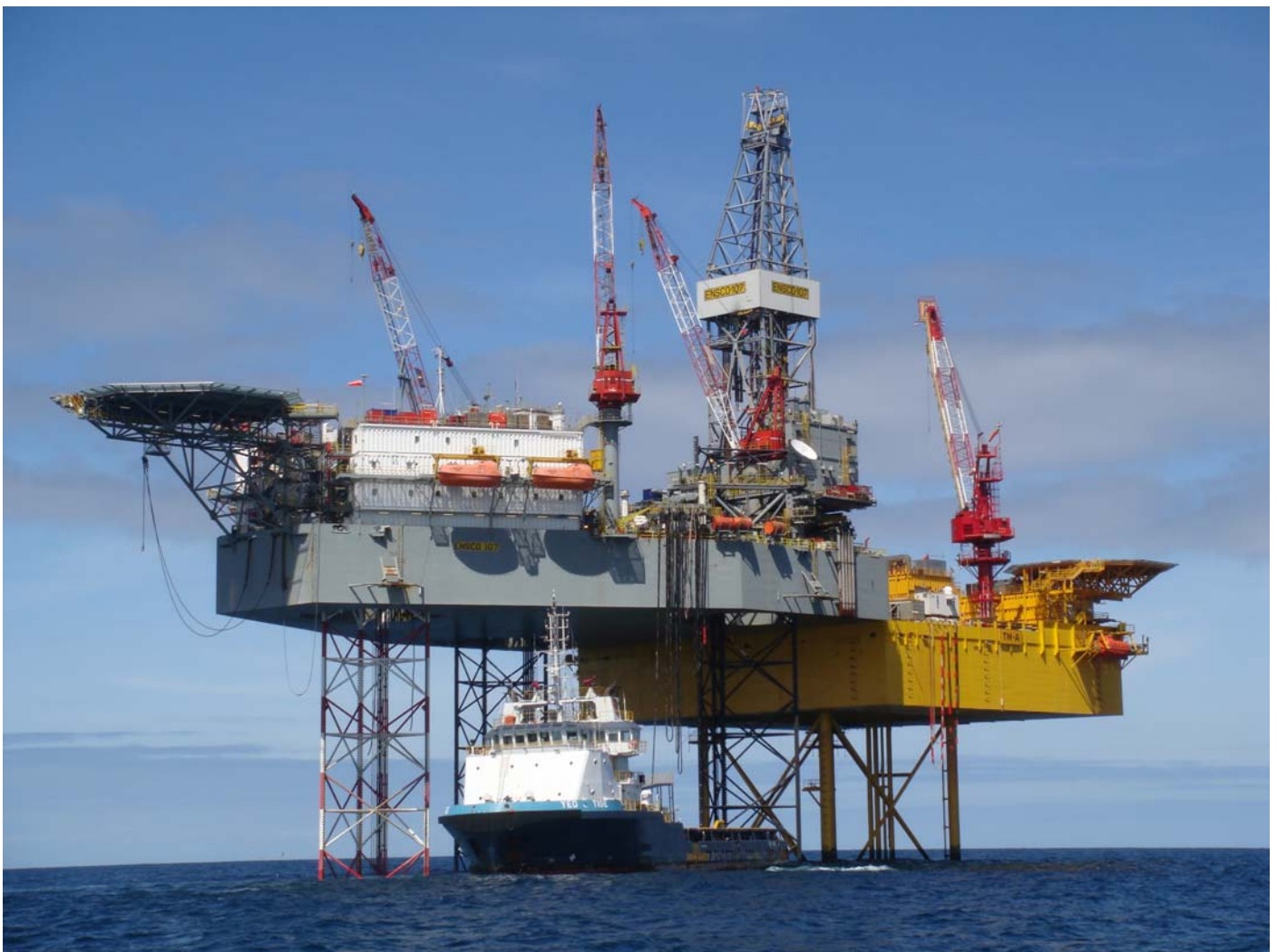
ENSCO 107 jack up drilling rig alongside the yellow coloured Maari well head platform

The oil production rate will ramp up towards the expected initial gross rate of 35000 barrels of oil per day as the five oil development wells are progressively drilled.